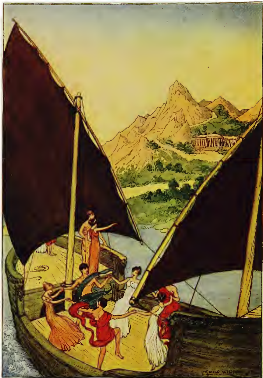
They never once thought whether their sails were black, white, or rainbow colored